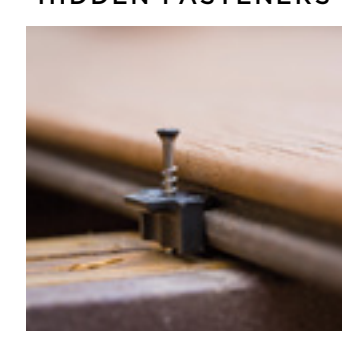
Sub-surface clips that leave a smooth, unfettered finish