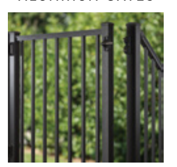
Strong, durable gates that can be customized for your space