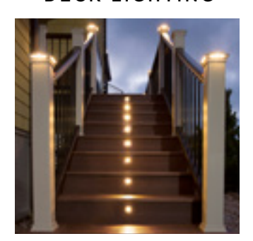
Energy-efficient lights that easily integrate into your decking and railing