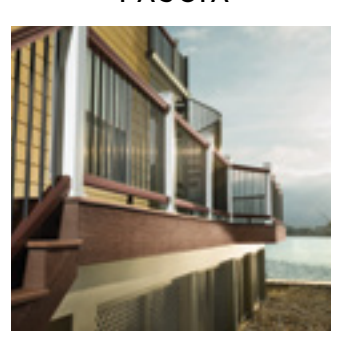
Gives a clean, polished look to stairs and sides of deck